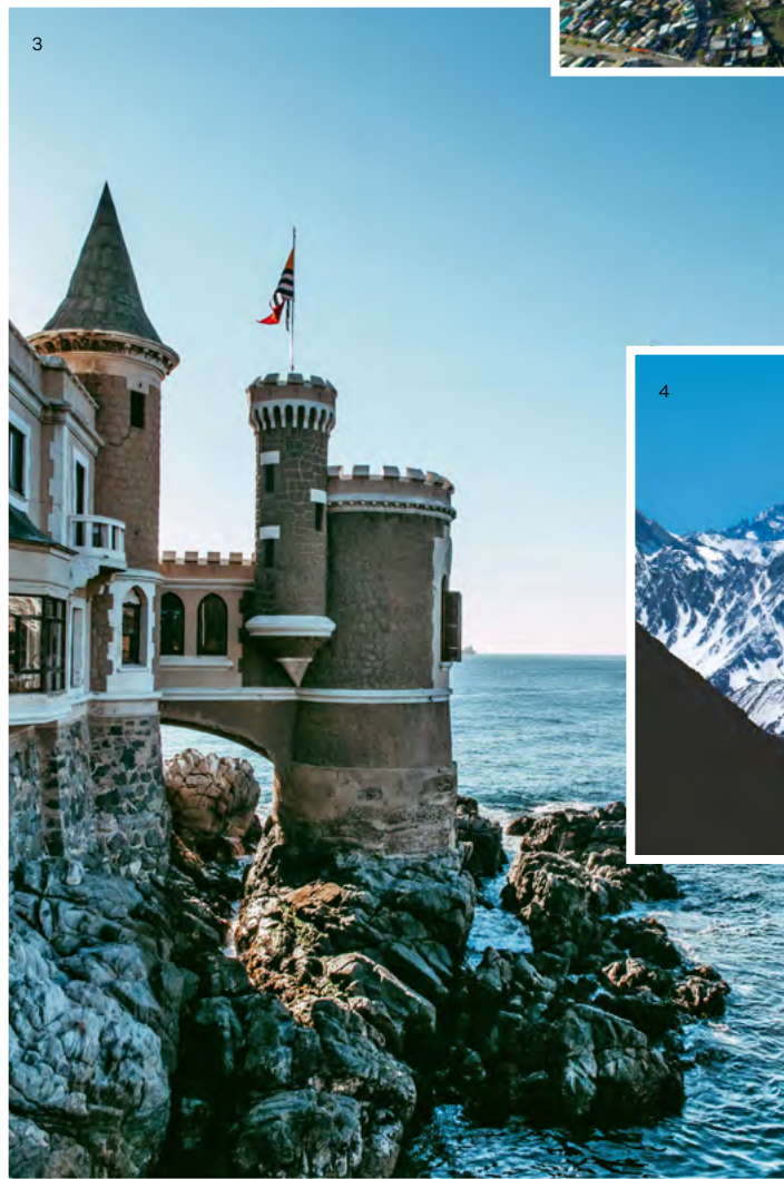
↑ San Antonio