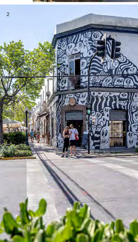
↑ Barrio Italia