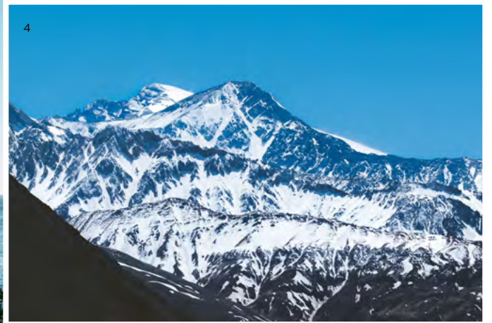
↑ Cajón del Maipo