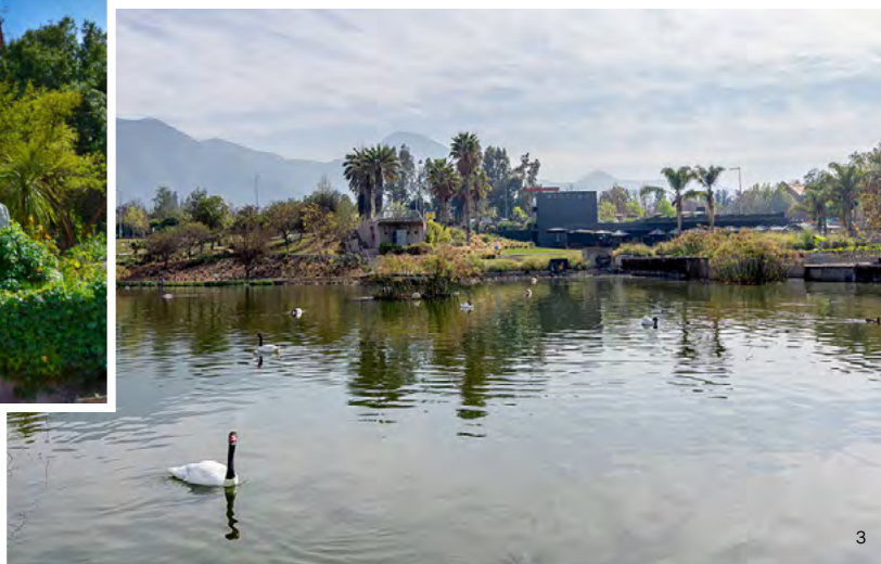
↓ Bicentenario Park