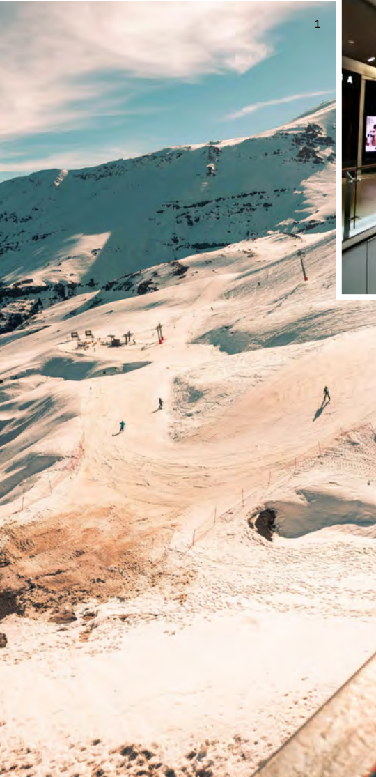
↑ Valle Nevado