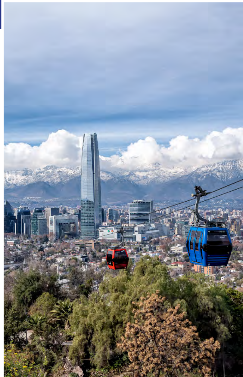
↑ Santiago Cable Car, San Cristóbal Hill

Several of the most important wine valleys in the country are located around Santiago, which are known for their Wine Route , where you can visit various vineyards.