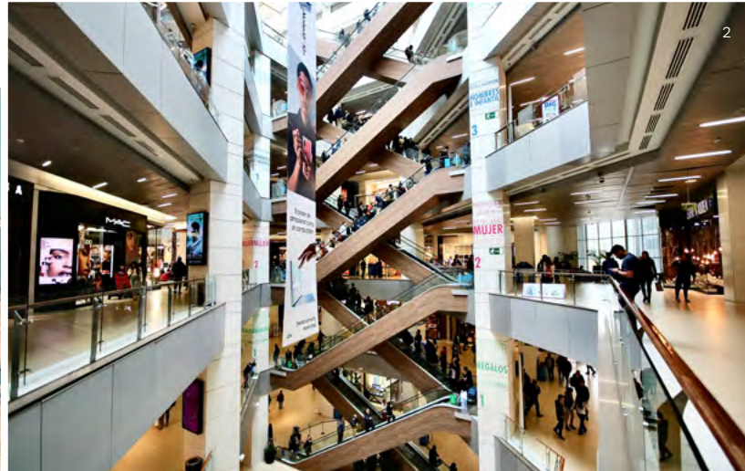
← Costanera Center