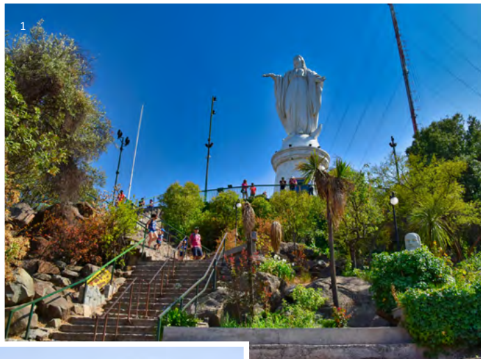
← San Cristóbal Hill