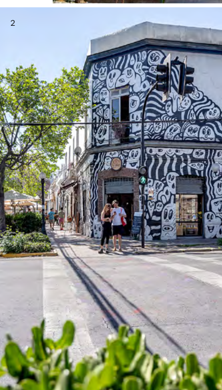
↑ Barrio Italia