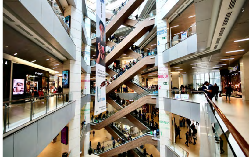
← Costanera Center