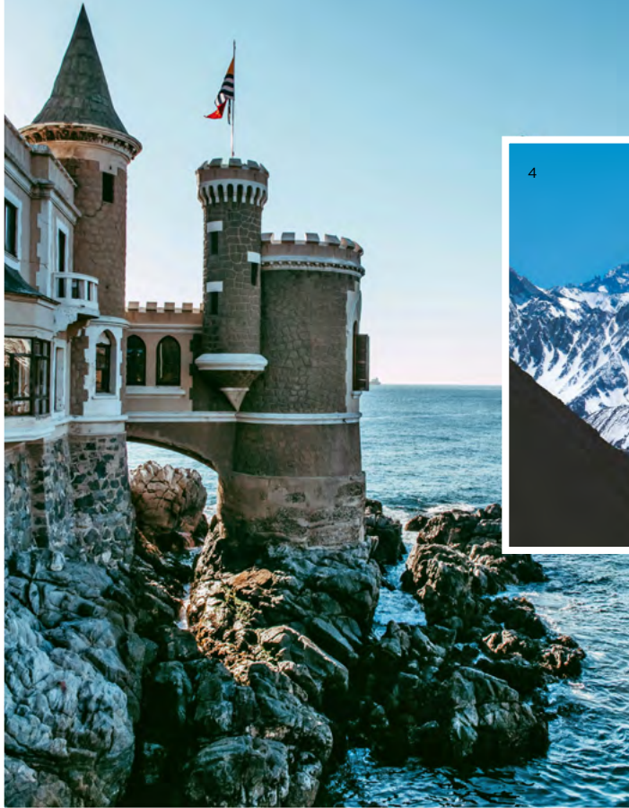
↑ Viña del Mar